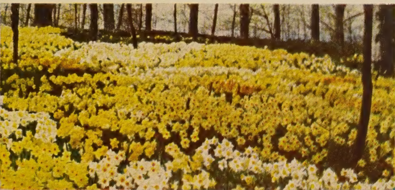
THE PINK DAFFODIL 12 for $2.50